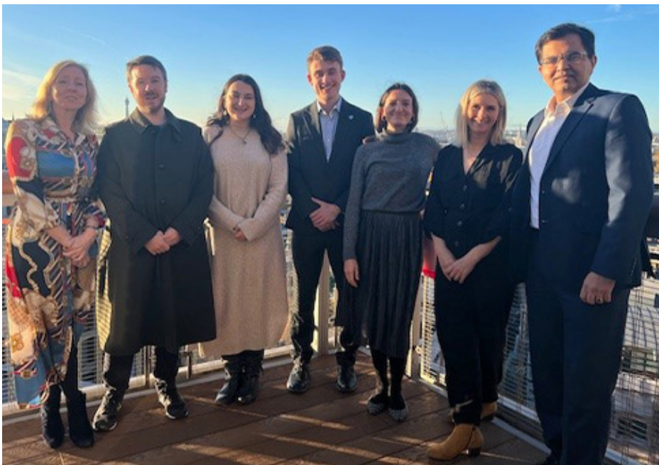
Pictured: LPRU Team in November 2023

The IBA is dedicated to bringing the legal profession's voice to the global stage. Its ongoing engagement with the UN and other key stakeholders reflects its recognition of the central role of the legal profession in meeting existing commitments under UN treaties and furthering best practice to promote and protect the rule of law. The LPRU looks forward to clarifying the scope of professional obligations with respect to various thematic topics such as climate change, business and human rights, judicial integrity, digital innovation, gender parity and anti-corruption, to further strengthen our collective understanding and appreciation for the profession.