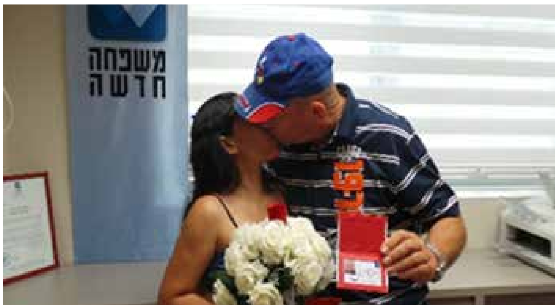
An interfaith couple supported by New Family, Israel

forms of discrimination, from the inability to marry, economic disadvantages, ineligibility for fertility treatments and adoption, to disqualification from purchasing state-owned lands and joining communal settlements and more, according to their religious and family status.