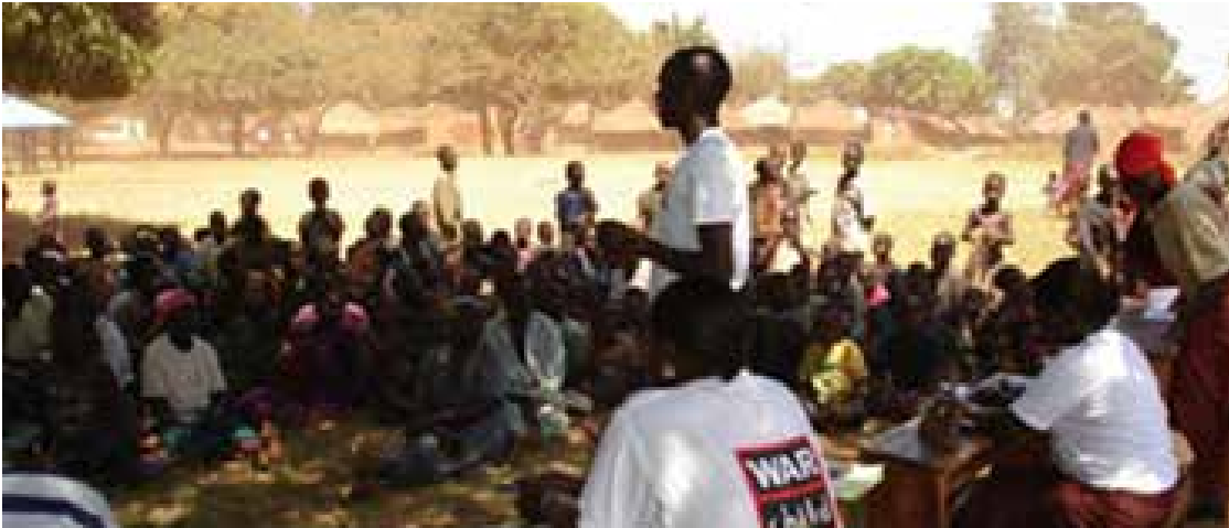
War Child Canada community awareness programme

times more likely to report that police and lawyers are effective in handling cases and 3.5 times more likely to report that perpetrators are being appropriately prosecuted.