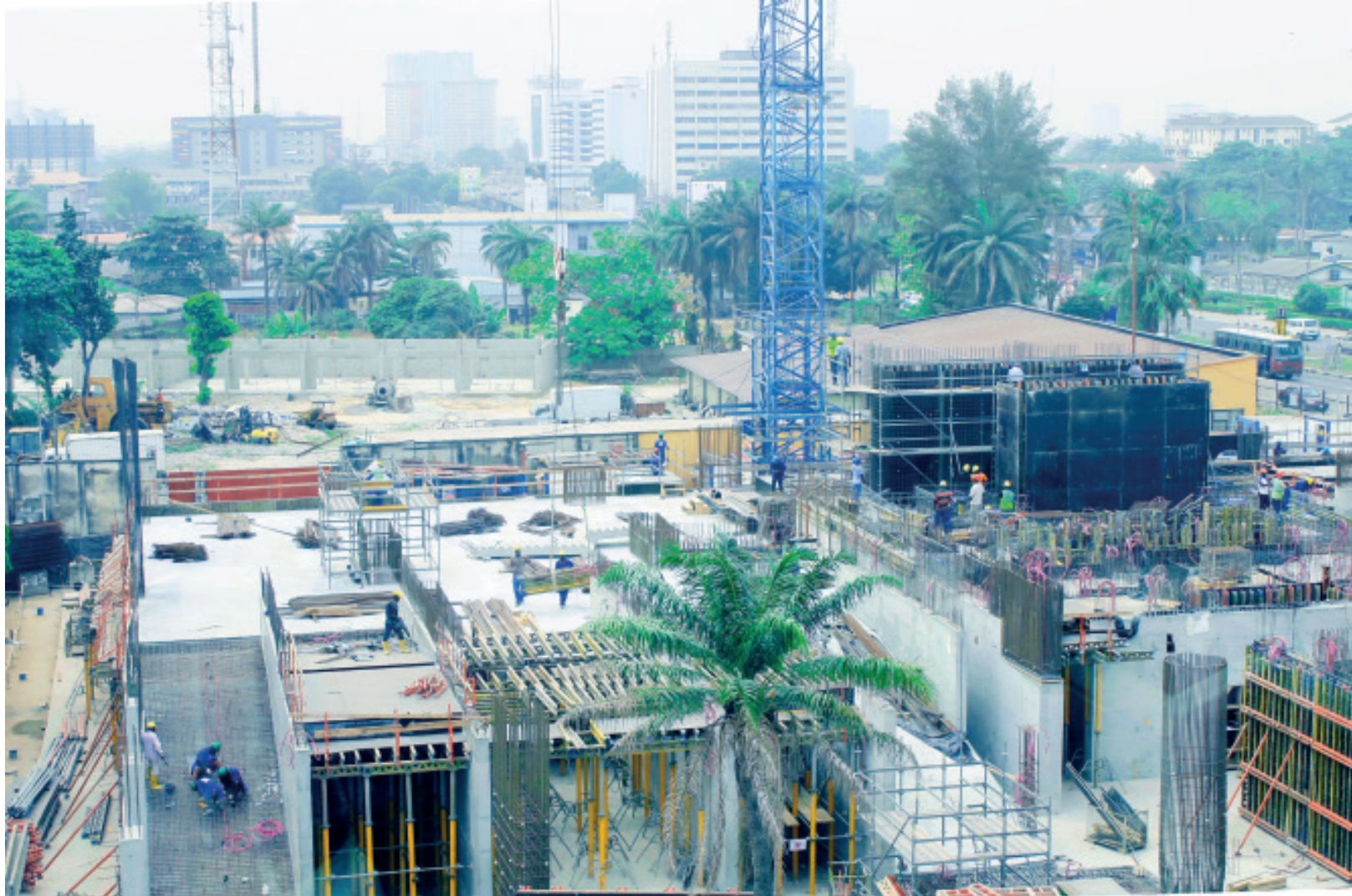
Men working on a construction site in Ikoyi, Lagos State, Nigeria.