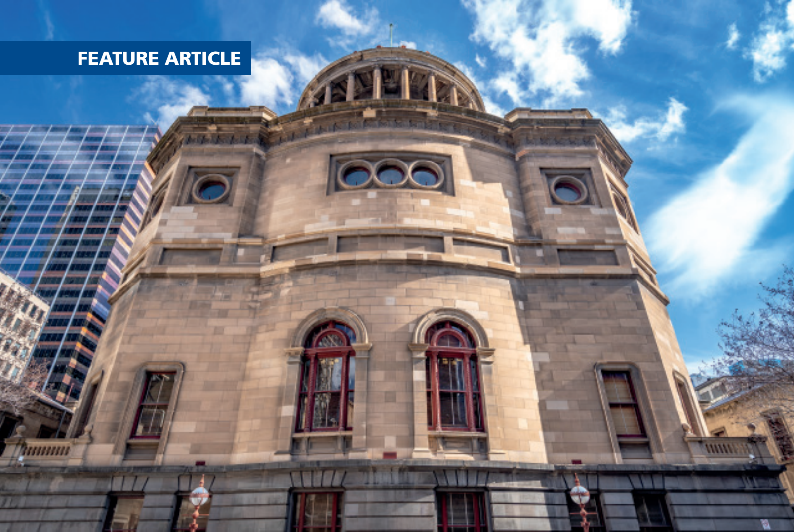
Supreme Court of Victoria, Australia.