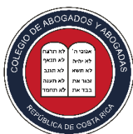
Costa Rican Bar Association Costa Rica