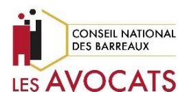
Conseil national des Barreaux France