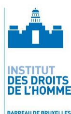
Institut des Droits de l'Homme du Barreau de Bruxelles Belgium