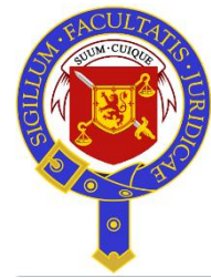
The Faculty of Advocates Scotland