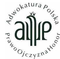
The Polish Bar Council Poland