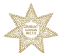
Colegio de Abogados de Lima Sur Peru