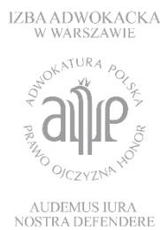
Warsaw Bar Association of Advocates Poland