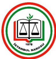
Istanbul Bar Association Turkey