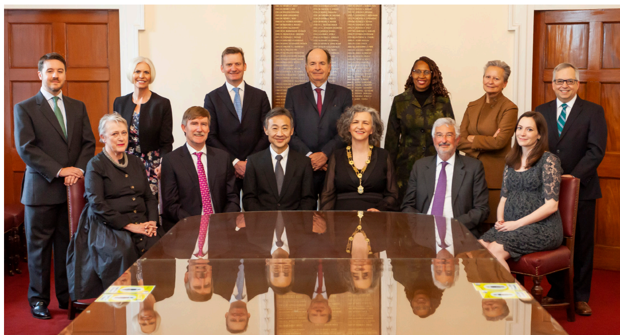
Bar Executives Committee members © IBA 2022