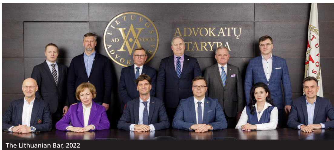
The Lithuanian Bar, 2022

Secretary-General, Lithuanian Bar, Vilnius