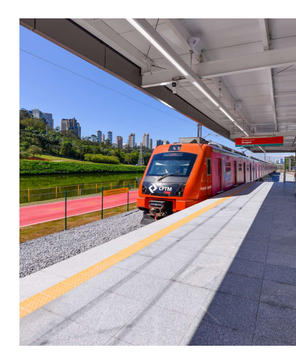
17007 Nações - Train Station