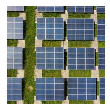
Renewable Power $72B