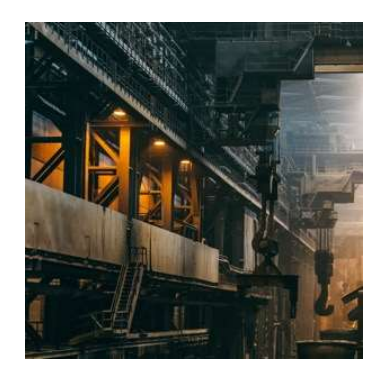
Private Equity $133B