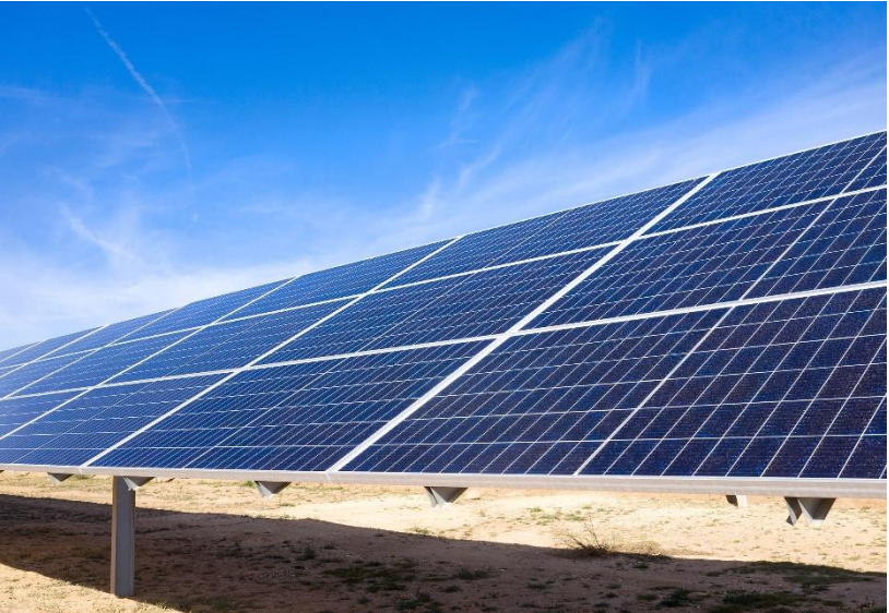
Tabernas solar park, Spain