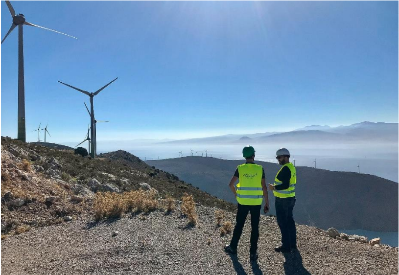
Desfina Wind farm, Greece