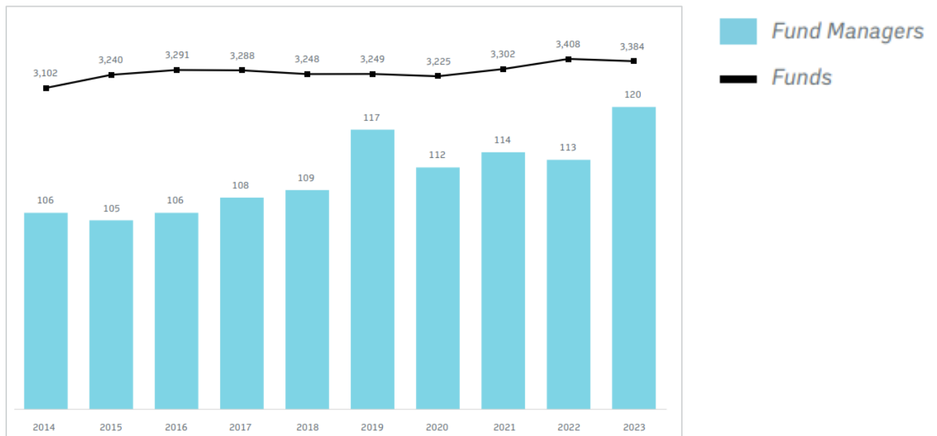
Canadian Fund Market. Data Source.

Please note. Detailed figures for Ontario and Quebec domiciled funds, do not appear to be readily available.