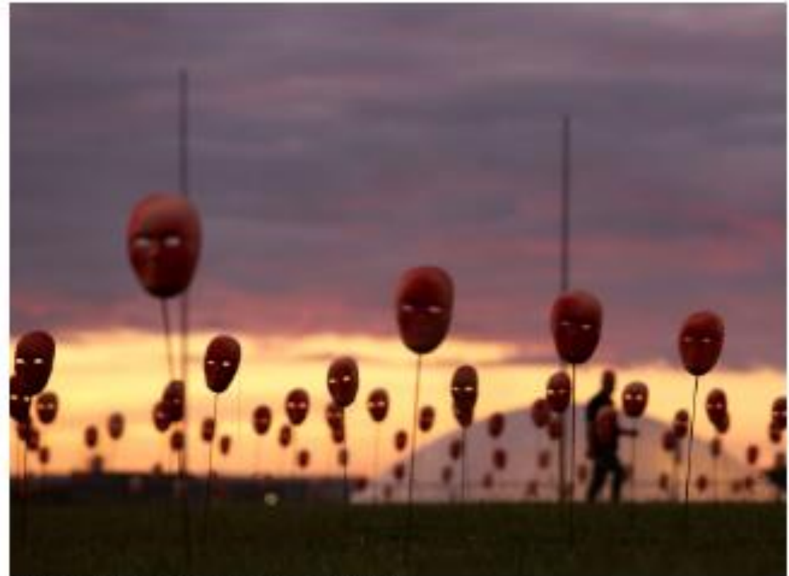
Brazil Corruption Probe