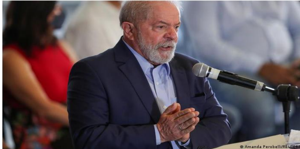
Luiz Inacio Lula da Silva remained a popular figure in Brazil, even when he was in prison.