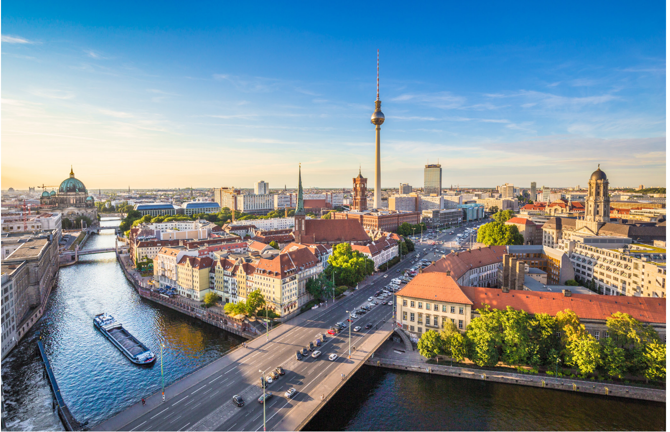
Berlin skyline.